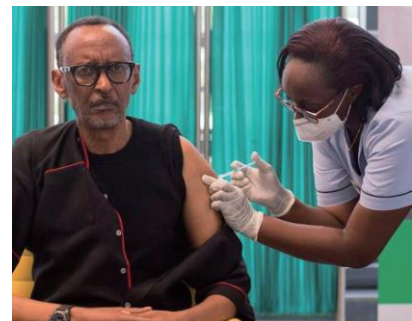
President Kagame of Rwanda was the first present who received COVID-19 vaccine in East African countries.

But Rwanda is concerned about the new variant from southern African countries. The Rwandese cabinet decided to stop direct flights from southern African countries and people entering from these countries must be quarantined for 7 days.