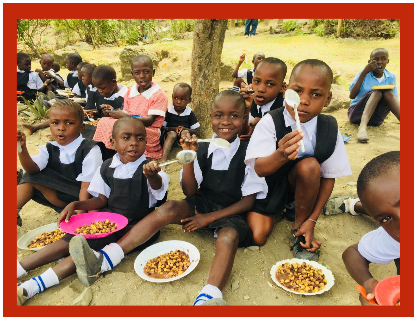
(Photo: Children having meals at schools before COVID-19)